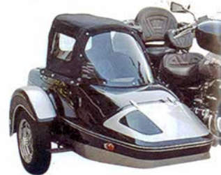
Classic with Soft Top on Honda