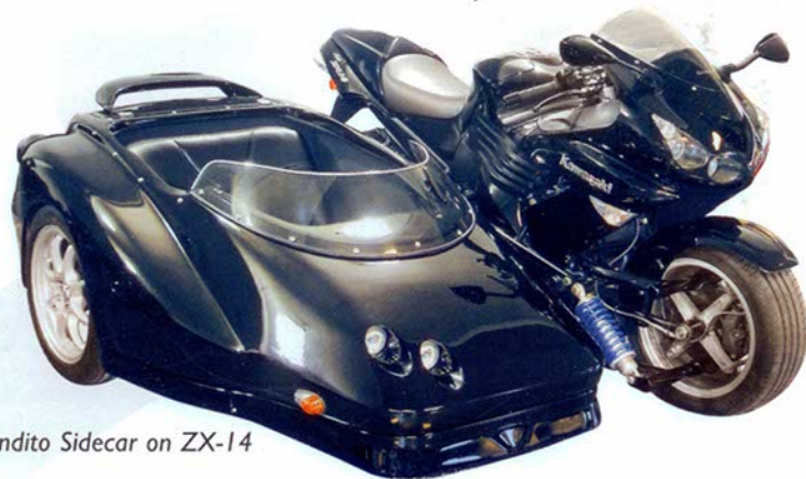
Bandito Sidecar on ZX-14