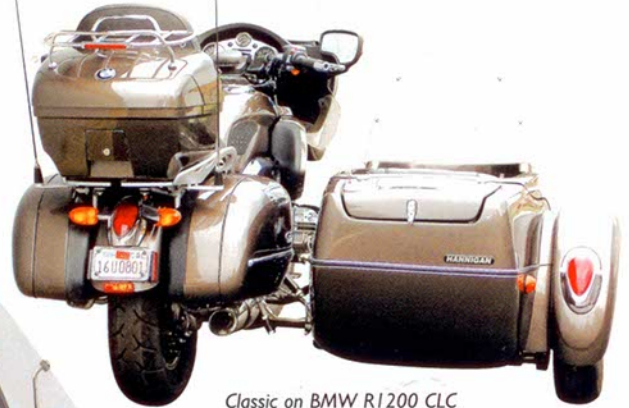
Classic on BMW R1200 CLC