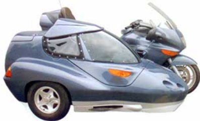
LT Open Concept with Removable Soft windows