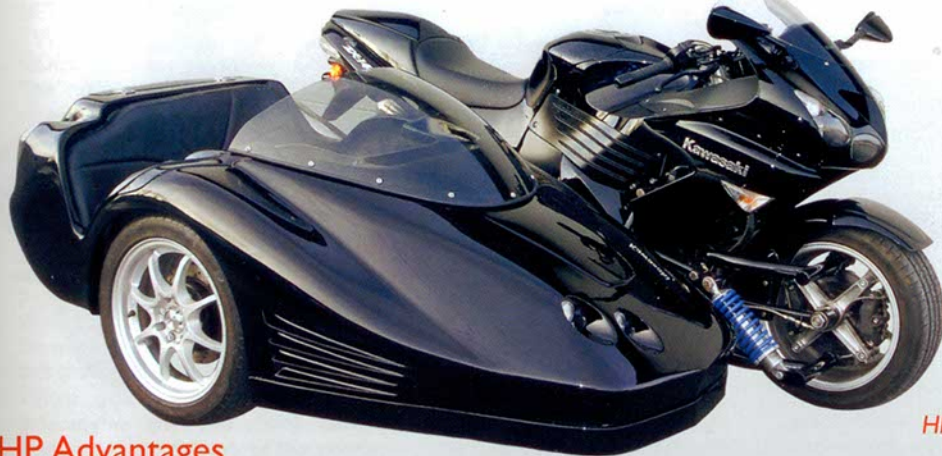
HP Sidecar on Kawasaki ZX-14