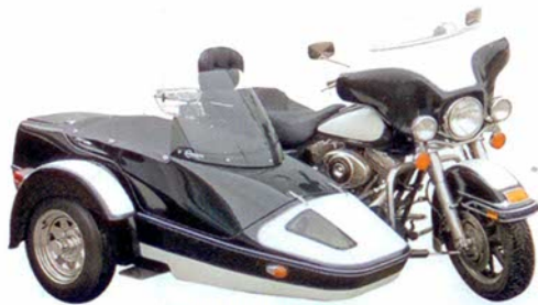
Classic on Harley FLH