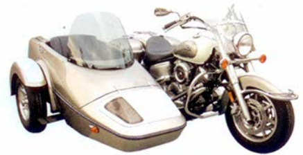
Classic on V-Star