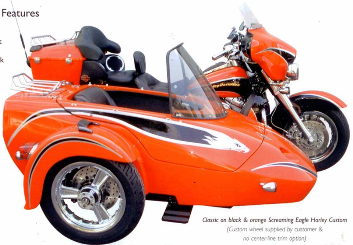
Classic on black & orange Screaming Eagle Harley Custom (Custom wheel supplied by customer & no center-line trim option)