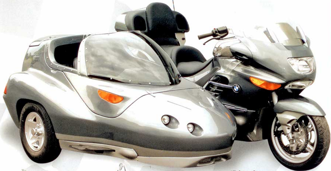
LT Open Concept

Almost any motorcycle can be paired with one of our 13 models of sidecars!