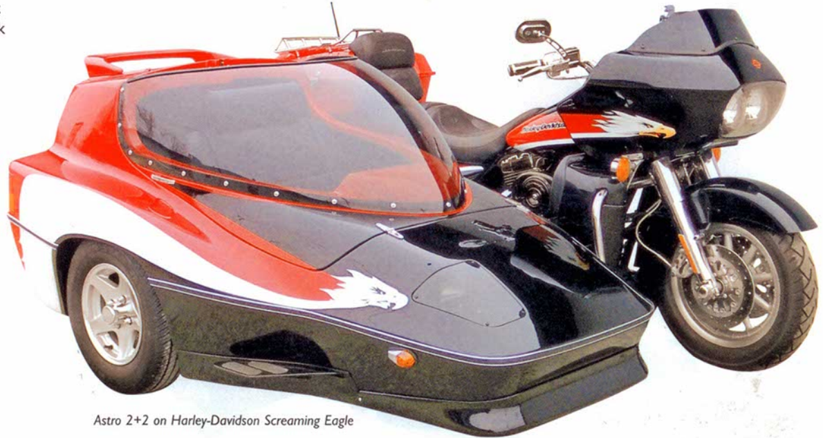
Astro 2+2 on Harley-Davidson Screaming Eagle