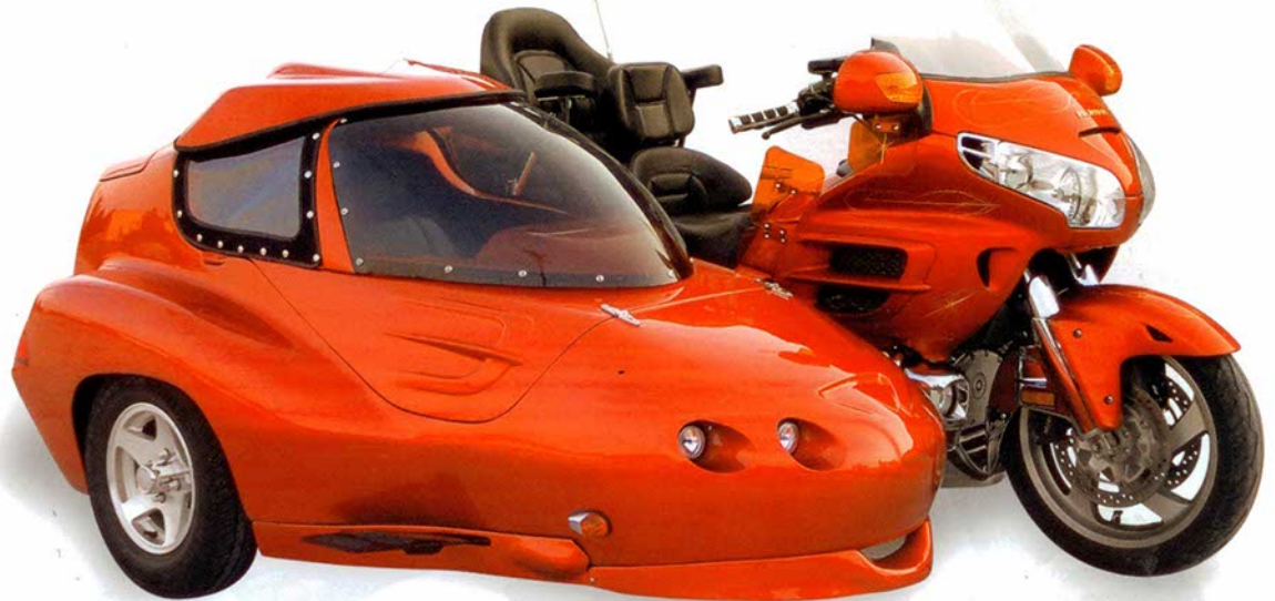
GTL Open Concept with Removable Soft Windows & Hard Top Roof