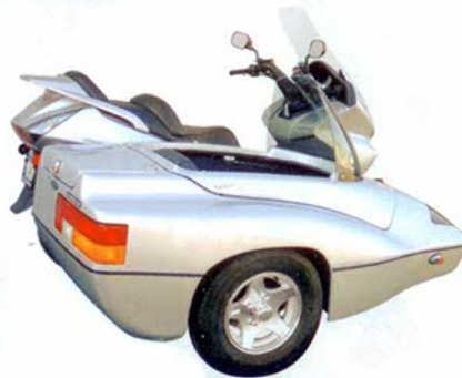
Conte' on Silverwing