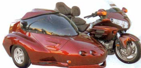
GTL with Wrap Around Windshield