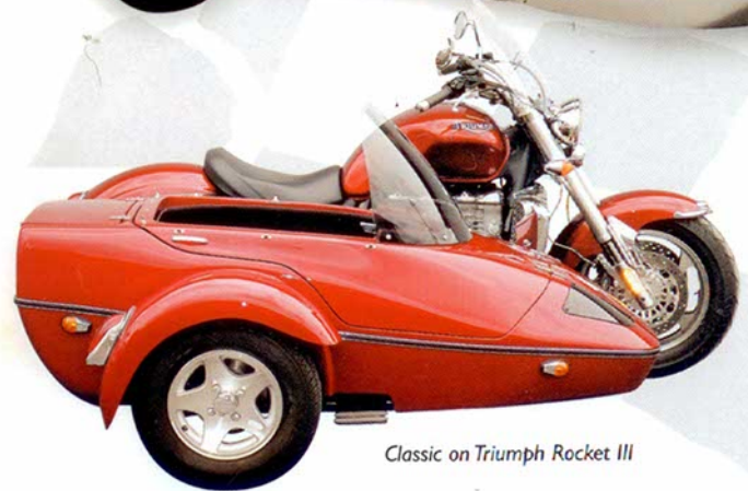
Classic on Triumph Rocket III