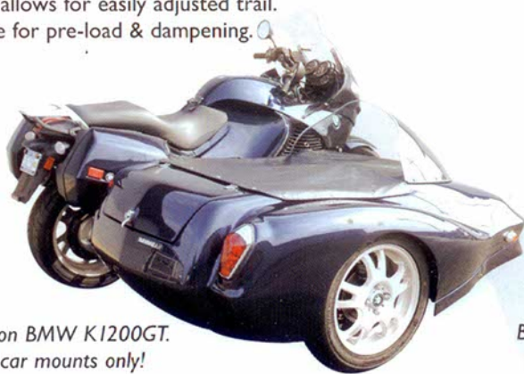
Bandito Sidecar on BMW K1200GT. Standard Sidecar mounts only!

Bandito body style is available without performance kit to mount on other motorcycles.