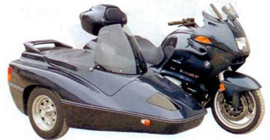
Conte' on BMW R1100RT