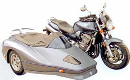
Sprint on Honda 919