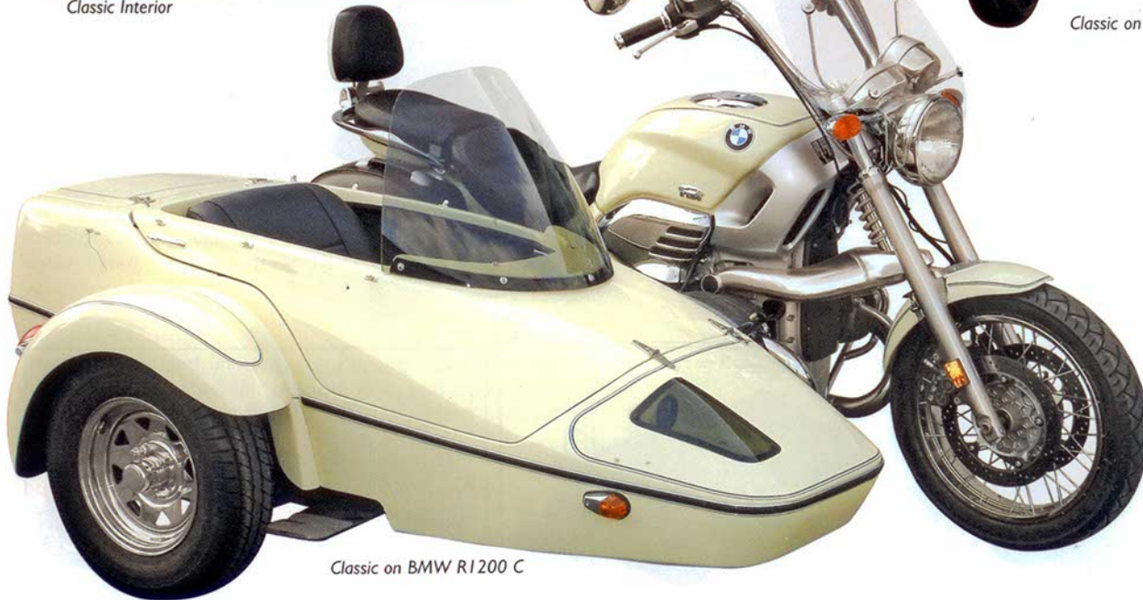
Classic on BMW R1200 C