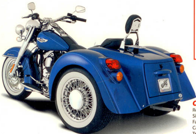
Photo Shown w/Optional Wheels

Kit Includes: Solid Axle | Pulley & Belt | Swingarm High-Performance disc brakes | Wheels & Tires All mounting hardware | All electrical components factory installed Reinforced fiberglass fenders w/gel coat finish Complete detailed instructions online