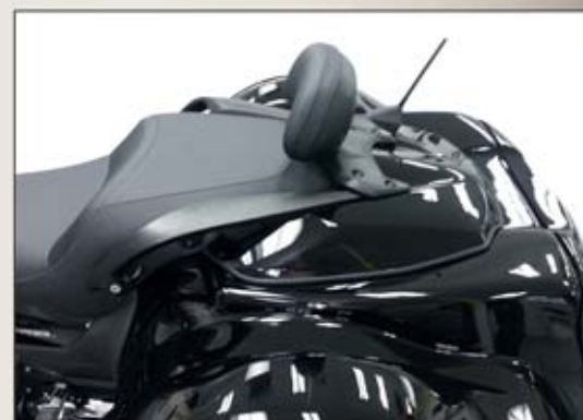
Passenger Back Rest

Wing EFX Running Boards • Light Bar • Hitch Kit • Wheel Upgrades • Mud Flaps • Trunk Mat & Liner • Passenger Back Rest • Trike Cover