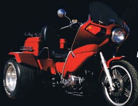
Lehman "Number 1"

Now based in Spearfish, South Dakota, Lehman Trikes are proudly made in the USA and feature our 3-year, unlimited mileage warranty. CrossBow and PitBoss trikes are also backed by the original Victory motorcycle warranty. Factory and dealer support for our products has earned Lehman an exceptional reputation. Lehman Trikes is proud to be working with Victory Motorcycles to deliver some of the most original and exciting products in the three-wheel motorcycle industry.