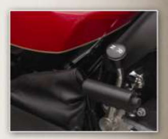
Parking Brake & Reverse

3. Who is the target buyer for the Renegade LLS? The Renegade LLS provides independent suspension that a large share of the trike market desires. Baby boomers, women, as well as people with physical disabilities will benefit from the Renegade LLS. Comfort, large trunk capacity, along with optional Adjustable Lean Control and raked triple tree all enhance the performance of this stylish touring trike.