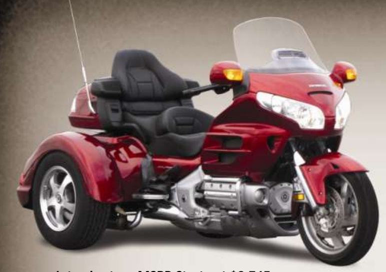
Introductory MSRP Starts at $8,745 Price does not include paint or installation