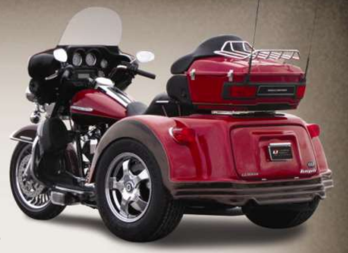
Introductory MSRP Starts at $8,745 Price does not include paint or installation

The touring industry represents a large portion of our sales. The Renegade has always been a best-seller among our customers and to stay competitive, we wanted to offer them another option in comfort. The LLS features the new Lehman Trikes rear independent suspension for a smooth and supple ride as well as an optional Adjustable Lean Control that allows the rider the ability to adjust the trike to their cornering preference.